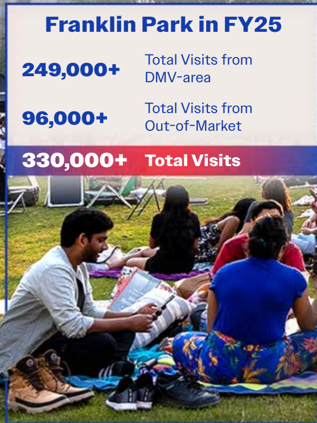
Visit numbers based on Placer.ai data.

workers, students, and visitors in FY25. Philanthropic support is made visible throughout Franklin Park, including new bench signage from supporters, in addition to existing signage acknowledging the Ann B. and Thomas L. Friedman Family Foundation's founding support of the park.